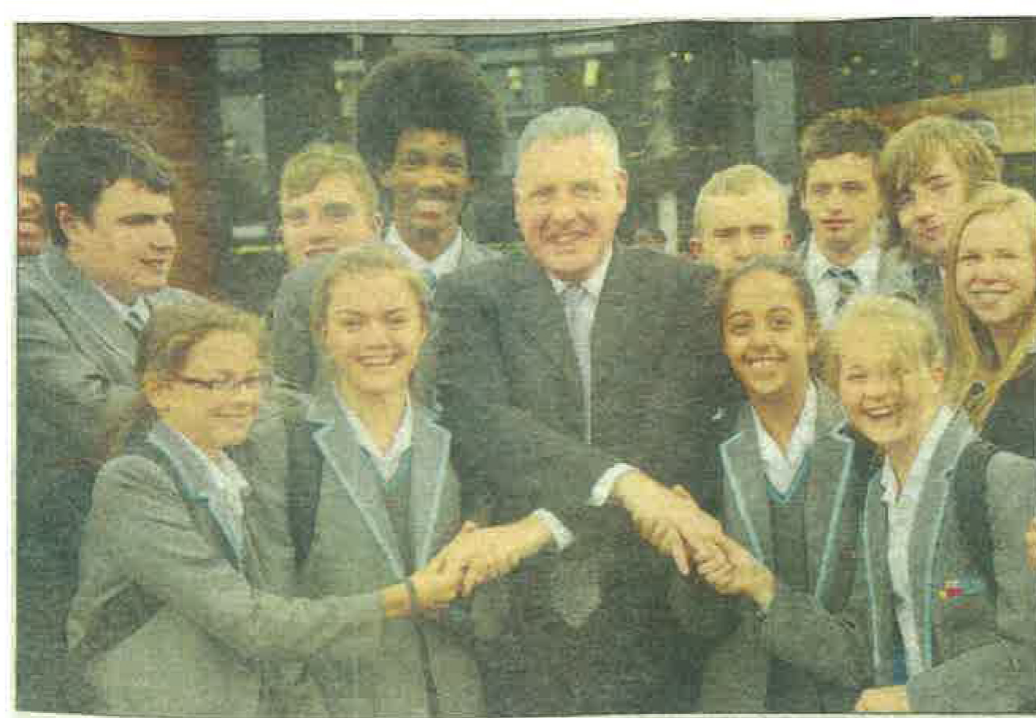
The X Factor: Shadow Minister of State for policing and criminal justice, Vernon Coaker, saying goodbye to Langley Academy pupils outside the school after his visit last week. 115550